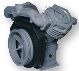
APLGAA-CH, APLGBA-CH, APLHAA-CH, APLHBA-CH Single-Stage Compressor